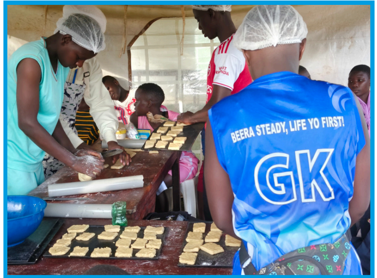
Young people participate in hands-on skilling session of bakery