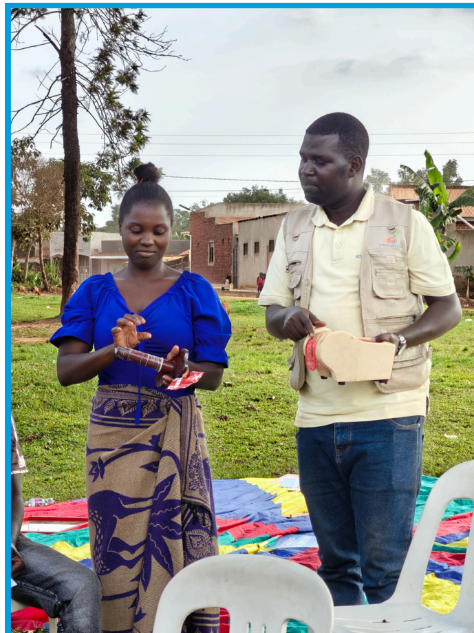
Youth Truck Project Officer demonstrates condom and femdom use