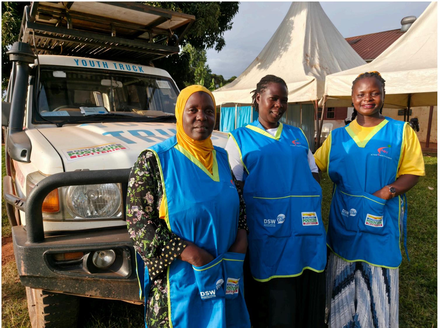
Health workers from Nagojje Health Centre III at the medical camp

The Youth Truck stationed in Nagojje, Mukono District on 26 th and 29 th May 2026 for a medical camp and on the go rights based training respectively. At the medical camp, health services included HIV testing and counseling, syphilis testing, malaria testing, general medical care, condom demonstration and distribution.