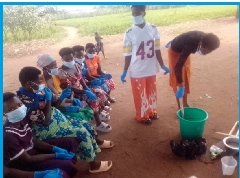
Liquid soap making