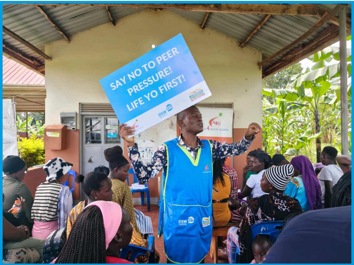
On the go rights-based training at the Youth Corner at Nagojje Health Centre III in Mukono District