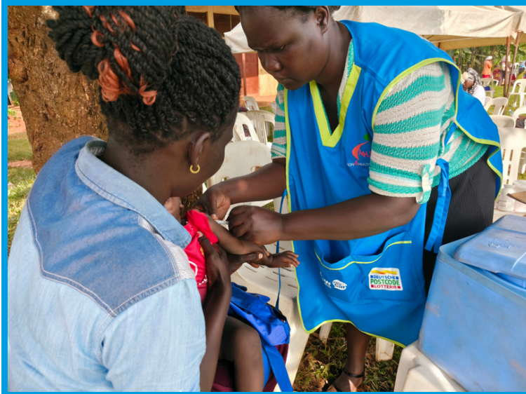
Health worker immunizes a child at the medical camp