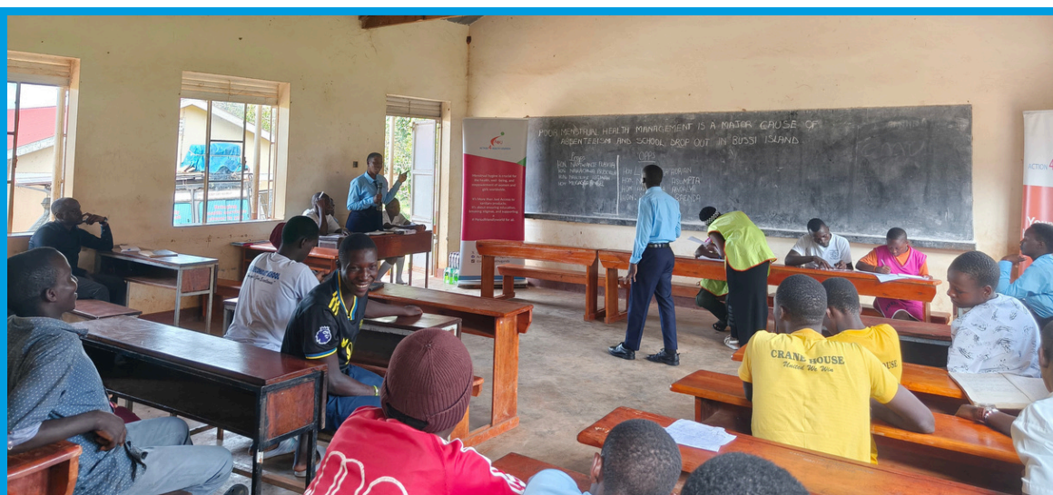
MHM Debate at Bussi Seed SS