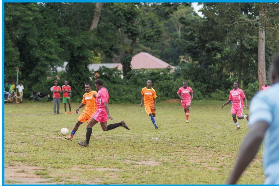
Football game in session