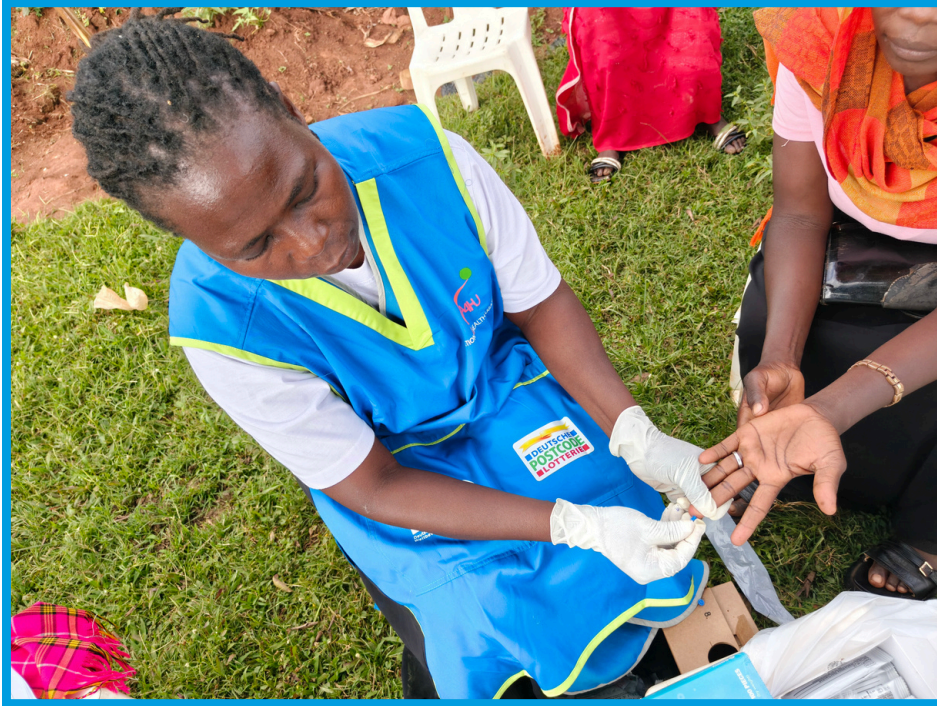
Health worker draws blood of a community member at the medical camp