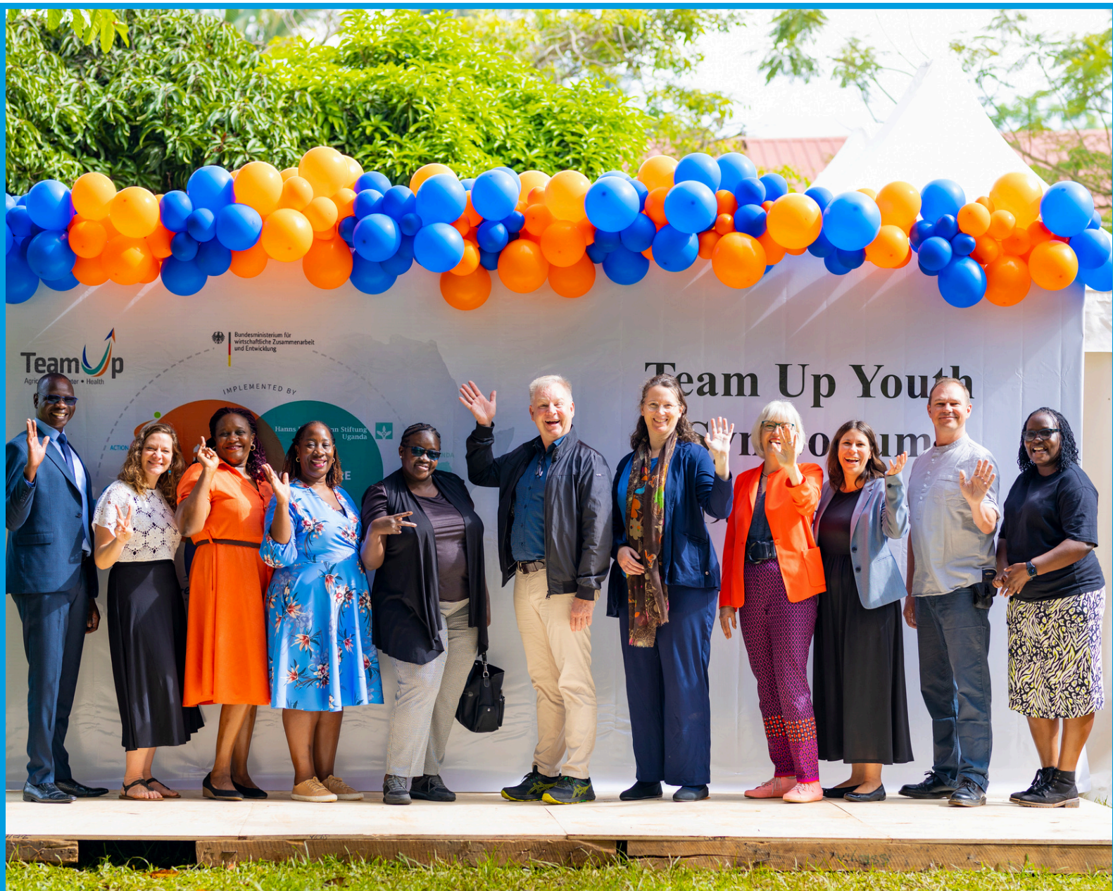
TeamUp Uganda program International Steering Committee and National Steering Committee members pose for a photo at the symposium photobooth