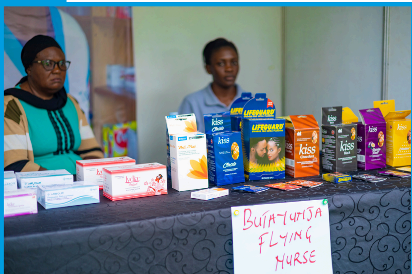
Flying Nurse from Butayunja Sub-County Mityana District displays her family planning products during the exhibition