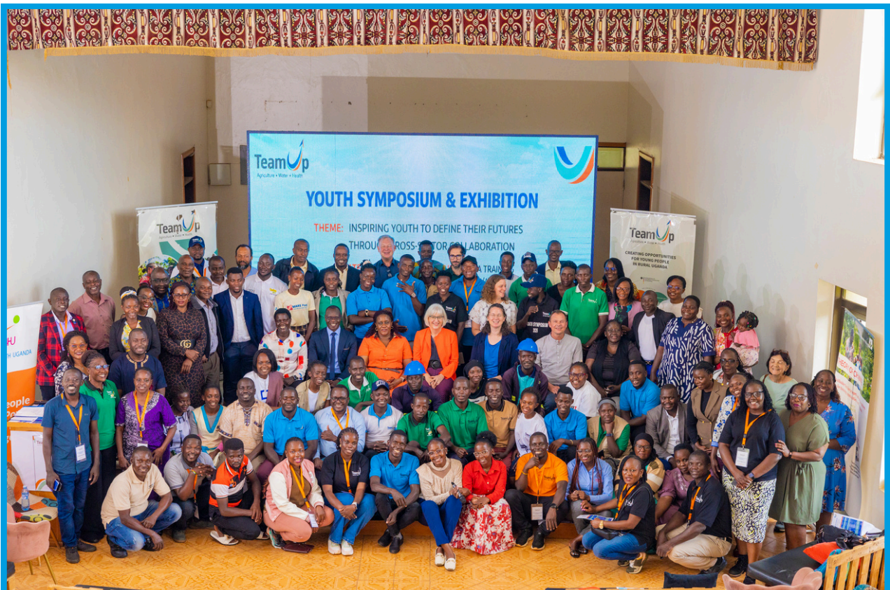
Stakeholders pose for a group photo