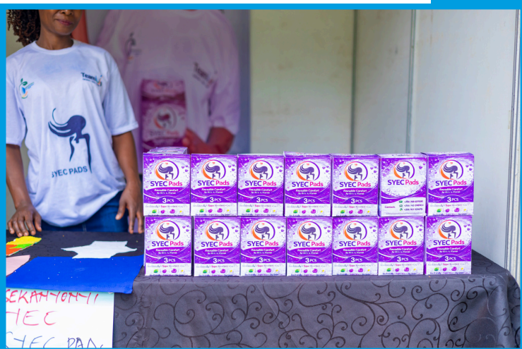
Ssekanyonyi Youth Empowerment Centre(SYEC) exhibition stall displaying SYEC reusable pads.