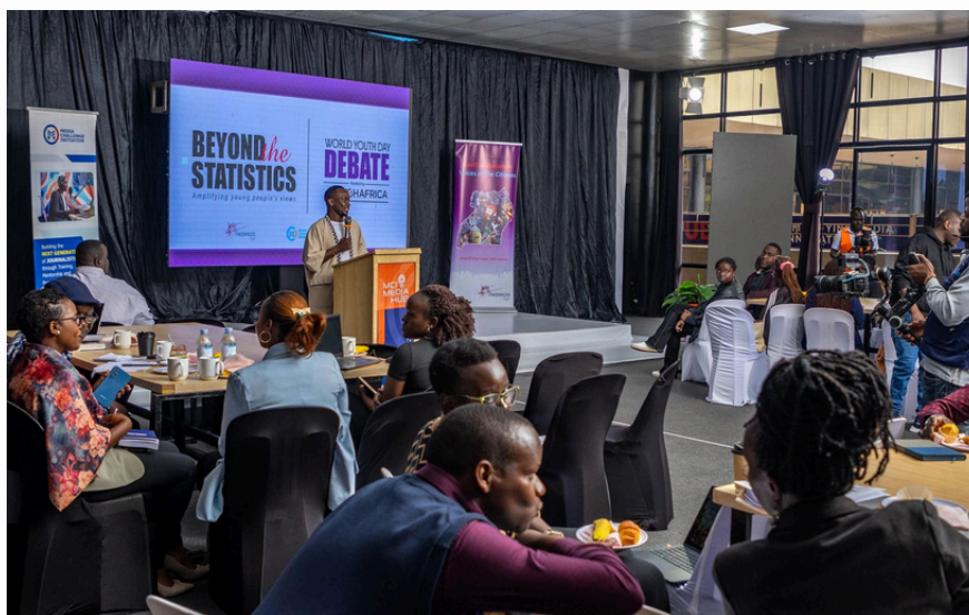
International Youth Day commemoration debate in session

Article Link: https://a4huganda.org/blogs/international-youth-day-commemoration-beyond-the-statistic-amplifying-young-ugandan-voices