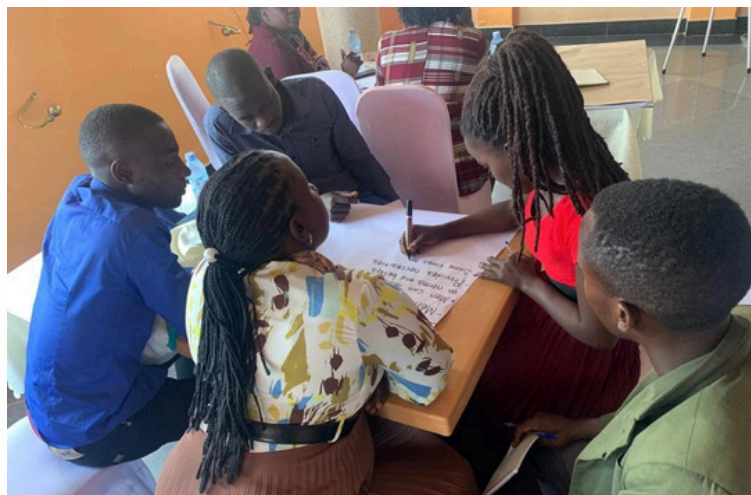
Meeting with the youth leaders and gender champions in Kassanda District