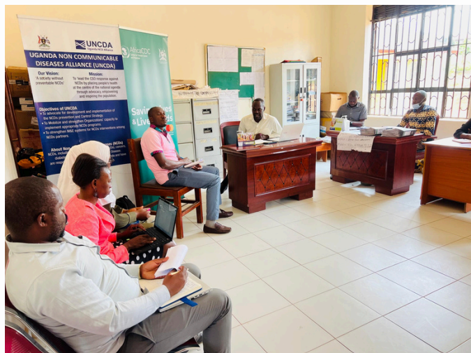
Meeting with Kassanda District officials

Together with facilitators from Kassanda District Health Team, these young changemakers shall lay the foundation for gender-responsive immunization strategies that leave no one behind in identifying and referring of both zero-dose and under-immunized children, who usually contribute to the continuous outbreaks of Vaccine-Preventable Diseases (VPDs) in North Central Region of Buganda specifically in Mubende, Kassanda and Mityana Districts.