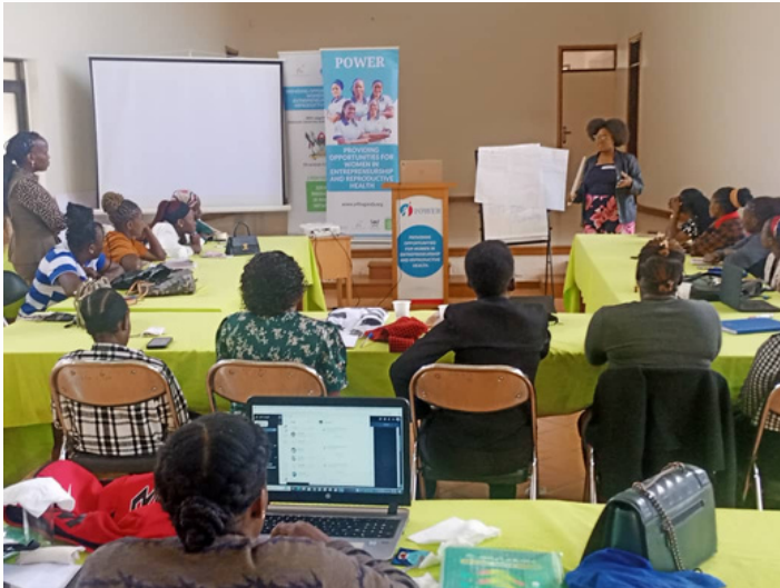
POWER ladies during a presentation session

Action 4 Health Uganda (A4HU), in partnership with Deutsche Stiftung Weltbevölkerung (DSW) and funded by The Waterloo Foundation, has launched Cohort 4 of the POWER-UP SRH Women-led Business Accelerator Project. POWER—Providing Opportunities for Women in Entrepreneurship and Reproductive Health—is a 24-month program running from March 2025 to March 2027.