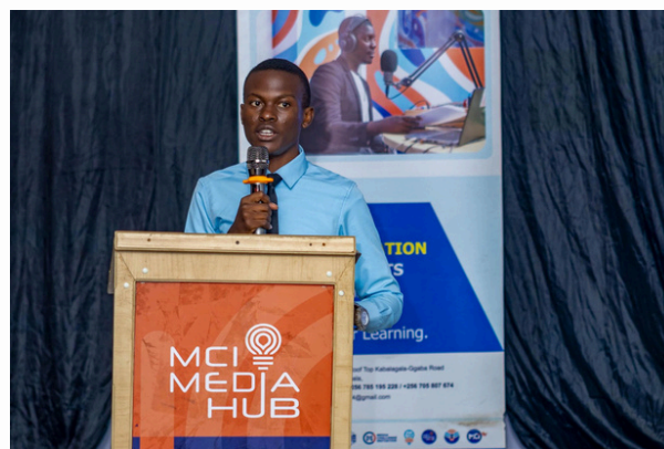
A4HU SRHR Advocacy Officer deliberates during the event

Instead of panels, participants joined World Café Debates, tackling provocative questions around these issues and proposing solutions, including paid internships, skills training, youth cooperatives, mentorship, and mental health support.