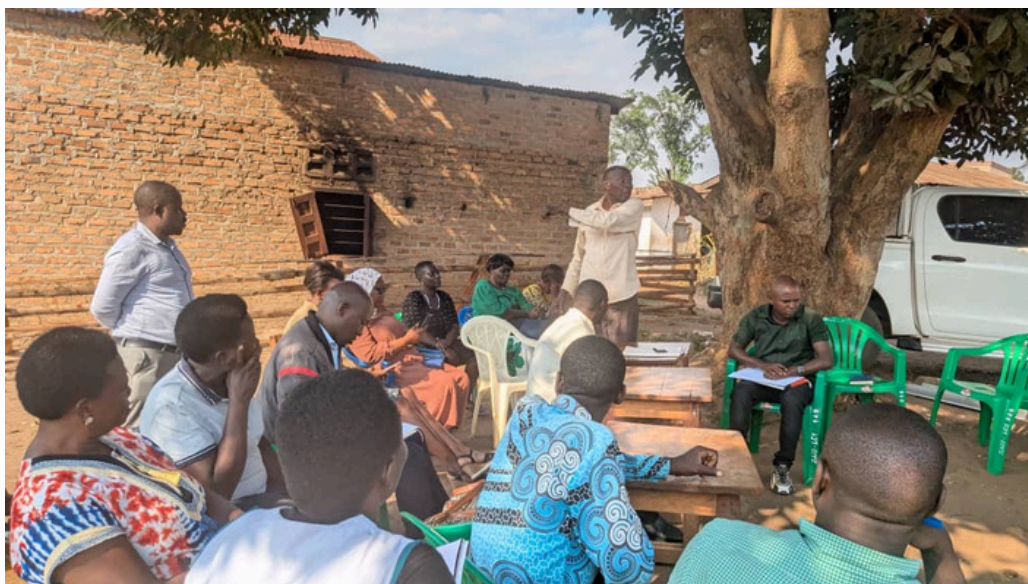
Meeting with local community leaders in Mubende District