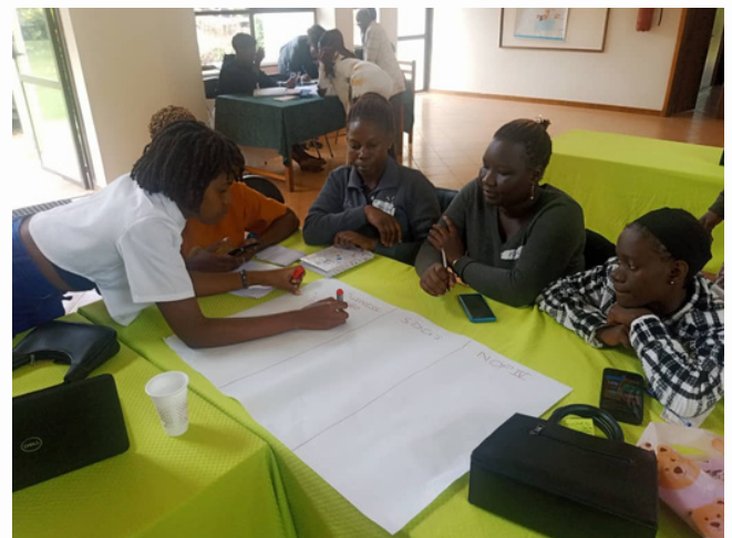
POWER ladies during group discussions