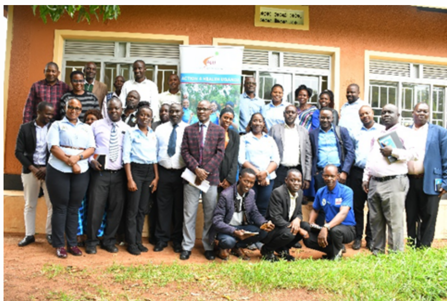
Group photo with Kyankwanzi District officials, TASO representatives and A4HU staff on August 21st 2025

This milestone builds on A4HU's journey of growth and impact, made possible through the strong foundation laid by Deutsche Stiftung Weltbevölkerung (DSW). With DSW's support, A4HU has scaled new heights in inspiring young people to realize their full potential, and is now expanding this vision through new strategic partnerships.