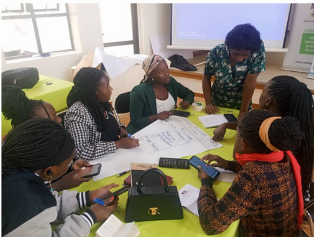
POWER ladies during group discussions

In the second year, participants will transition into technical assistance and investment financing through the multi-sectoral investment fund (MIF), refining their ventures with sustained mentorship. Cohort 4 builds on POWER's mission to strengthen SRH solutions, advance gender equality, create jobs, and connect women entrepreneurs through its growing alumni network.