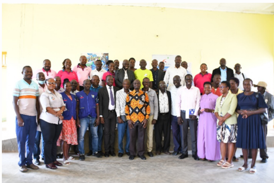
Group photo with Buliisa District officials, TASO representatives, and A4HU staff on August 22nd 2025