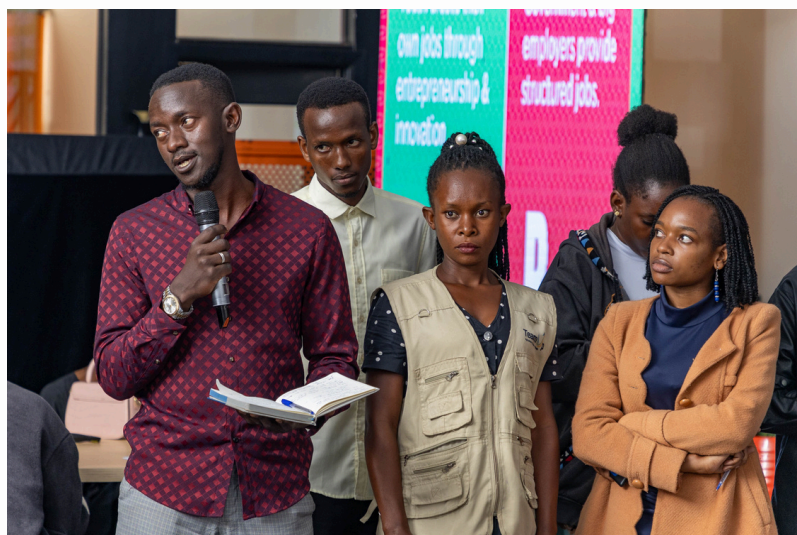
Youth Champions address the gathering at the debate event

A4HU emphasized youth-friendly health services and, alongside Youth Champions from Mityana and Kassanda, led by the SRHR Advocacy Officer, showcased how young people can influence local governance. The event concluded with youth recommendations and policy commitments, underscoring that youth are not problems to be solved, but solutions to be embraced.