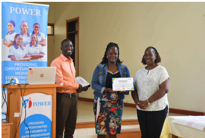
Young people during the intergenerational dialogue