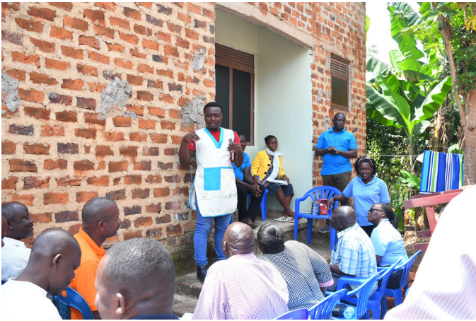
A male Flying Nurse addresses the team that visited his workstation in Malangala Sub-County, Mityana District

Action 4 Health Uganda participated in a support supervision visit to various implementation sites under the TeamUp Uganda program in Mityana and Kassanda Districts. This was an exchange learning opportunity for the three implementing partners under the TeamUp Uganda program to benchmark and share knowledge. Various stakeholders from the districts, CSOs and Government agencies were also present during the visit. The team visited one of the newly renovated Youth Friendly Corners in Malangala Sub-County of Mityana District and also engaged with the Flying Nurse in the same sub-county. The activity shed more light on the work we do in improving the health outcomes of the young people and how best to work with a cross-sector approach incorporating health, water, and agriculture.