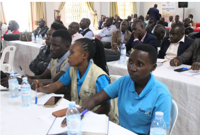
Young people during the intergenerational dialogue

Pre-event activities included an intergenerational dialogue addressing the issue of teenage pregnancy and community health outreach, where health services were provided free of charge to local residents. Young individuals from our networks in Mityana District participated in the dialogue, allowing them to connect with various stakeholders.