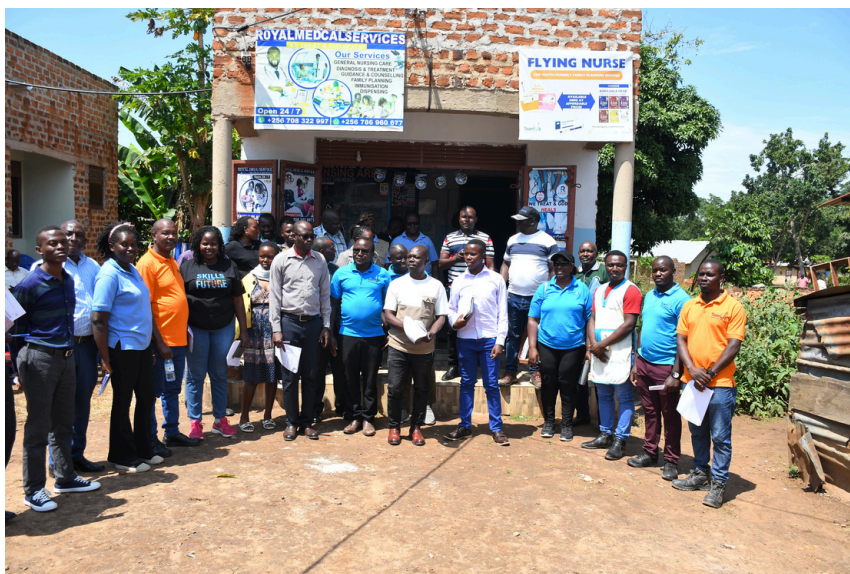
The team poses for a photo in front of the Flying Nurse's station in Malangala Sub-County, Mityana District