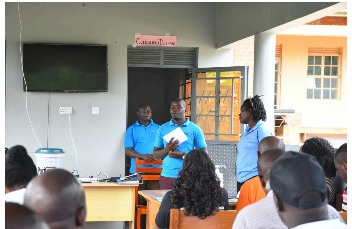
SRHR Personnel addresses the team at Malangala Youth Friendly Corner in Malangala Sub-County, Mityana District