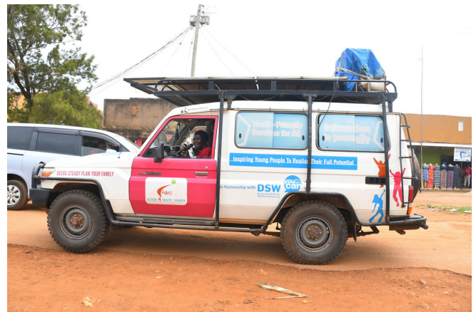
Youth Truck mobilization for community health outreach