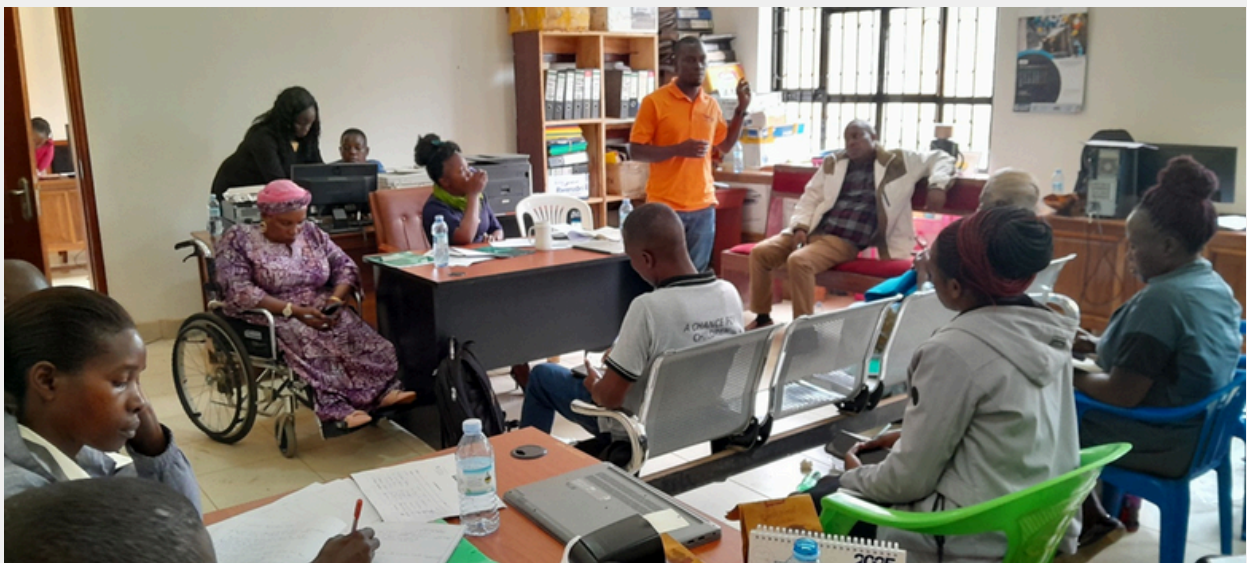
The project officer -Youth Organization Development sharing the impact of TeamUp to the committee.

The District Community Development Officer (DCDO) commended CSOs for their contributions and encouraged continued alignment with the district's vision of transforming Kassanda into a modern, competitive community. Key district expectations included timely reporting, renewal of operational documents, and participation in district-led initiatives such as the Day of the African Child celebrations. TeamUp Uganda partners shared progress, including the operational Youth Empowerment Centres in Kamuli and Myanzi, which offer health education, peer support, and service referrals. Youth are also receiving training in agronomy, with a value addition facility established in Kyoga. Whave Solutions reported sustained access to clean water through preventive borehole maintenance. The availability of clean water facilitates menstrual hygiene for young girls and women, among other health benefits.