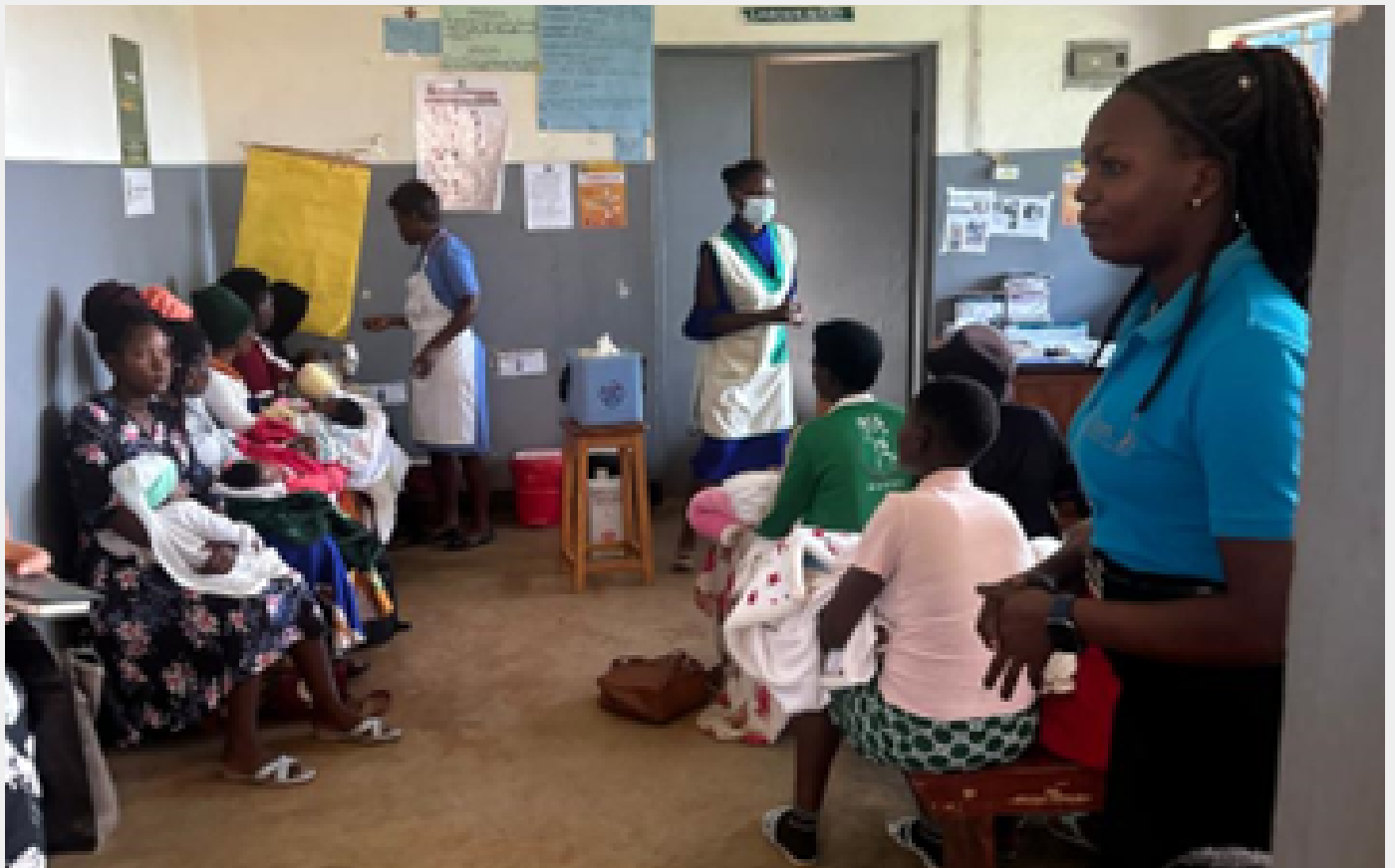
Mothers wait for their children's immunization at a health facility in Mityana District.

A4HU has partnered with PATH, expanding our scope into the immunization sector to promote Reproductive, Maternal, Newborn, Child, and Adolescent Health (RMNCAH). This program is active in Mityana, Kassanda, and Mubende Districts. Our existing operations in Mityana and Kassanda Districts, through the TeamUp Uganda program, provided a seamless entry point for the new initiative and supported our geographical expansion into Mubende District. This program aims to raise awareness and increase demand for vaccines in the selected districts, thereby preventing vaccine-preventable diseases. This is all thanks to GAVI, The Vaccine Alliance.